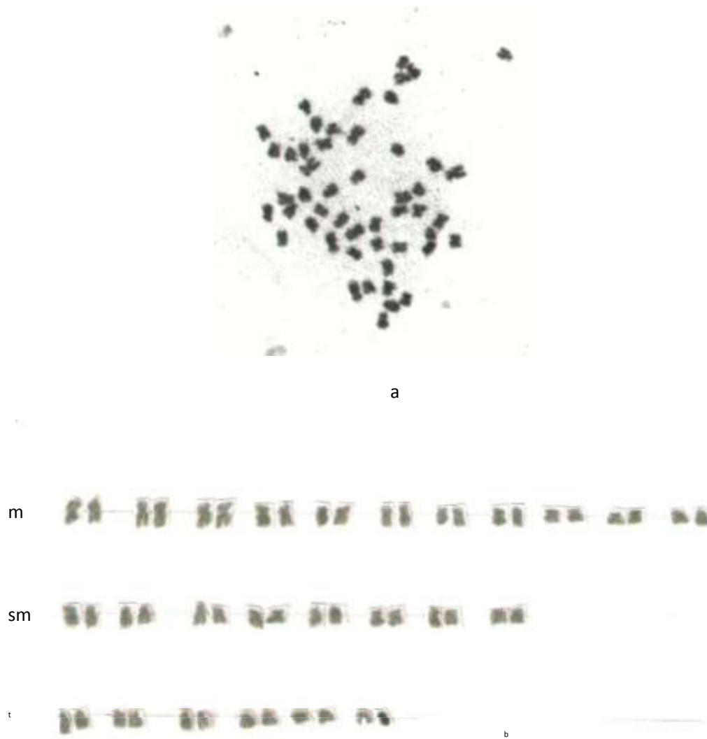
Figure 1. (a) Chromosome preparation and (b) karyotype.