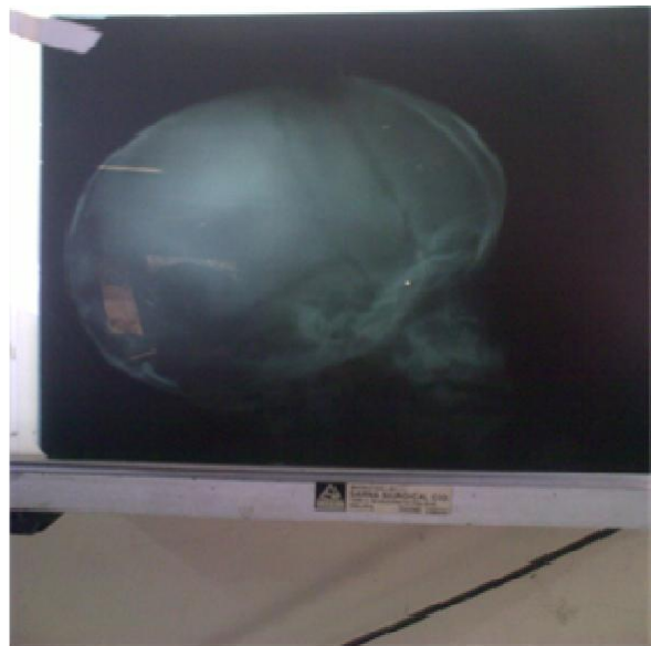
Figure 4. Open anterior and posterior fontanelles

count was 2.8 \times 10^5/\mu\text{L} , S. \text{Ca}^{++}=9.8\text{mg/dL} , S. Creatinine= 0.6 mg/dL, Alkaline phosphatase 200 IU/L. However, there was generalized increase in bone density on limb X-rays, hypoplastic distal phalanges, and open skull sutures as