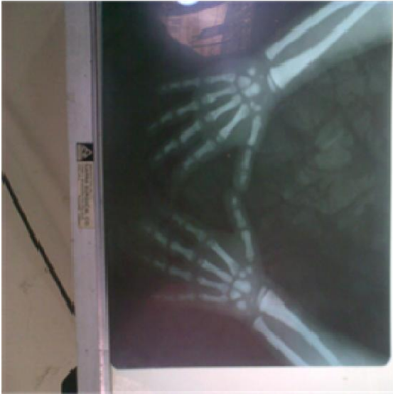
Figure 5. Showing increased bone density, with acro-osteolysis of terminal phalanges

bilateral otosclerosis with 52 decibel hearing loss. (Figure 6)