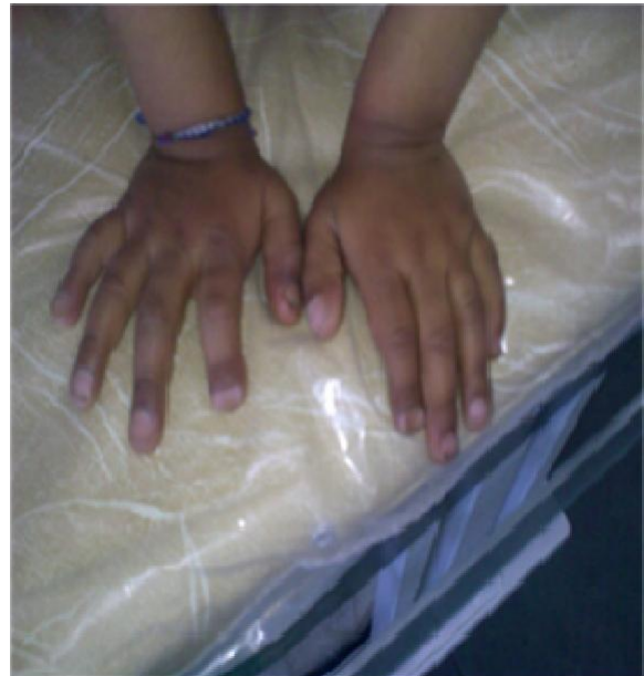
Figure 2. Showing flat and grooved nail