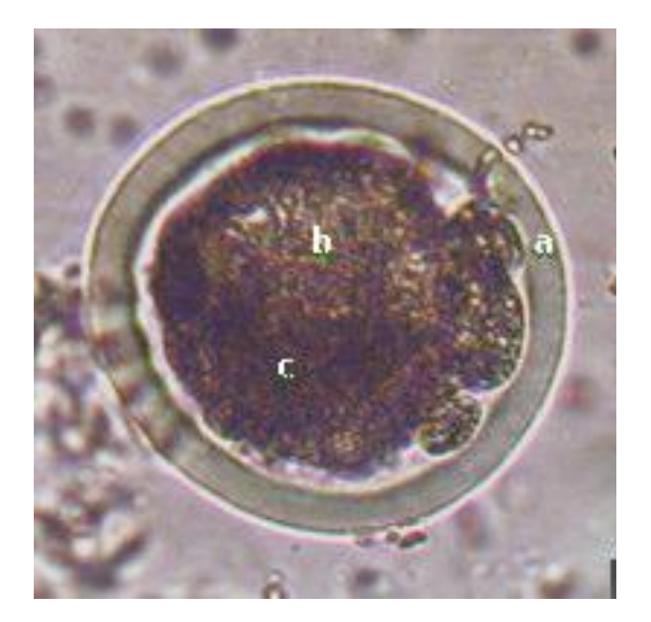
Figure 3. Early Blastocyste (x 100). a : zona pellucida, b : blastocoel, c : Inner cell mass.