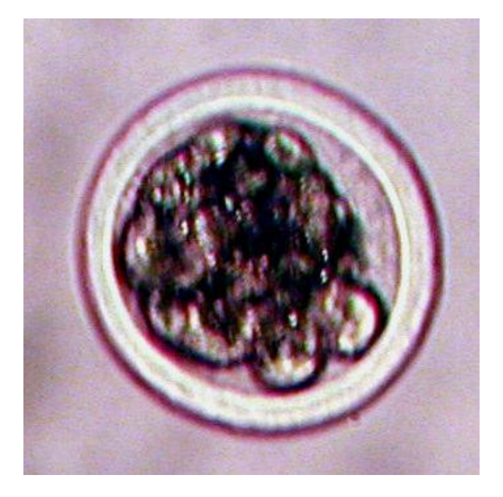
Figure 4. Morula stage (x 100). a : zona pellucida, b : blastomere.

et al. (1986), which were respectively of 6.5 and 6.9, with a lowest dose of pFSH for "Baoulé" cows breed. However, it is higher than those reported by Diop et al. (1994) and Jordt et al. (1986), which were respectively of 5.06 and 4.5, with a lowest dose of pFSH for "N'dama" cows breed. Elaidi et al. (1996a) have obtained a biggest response to treatment for "Oulmes Zaer" cows breed, when