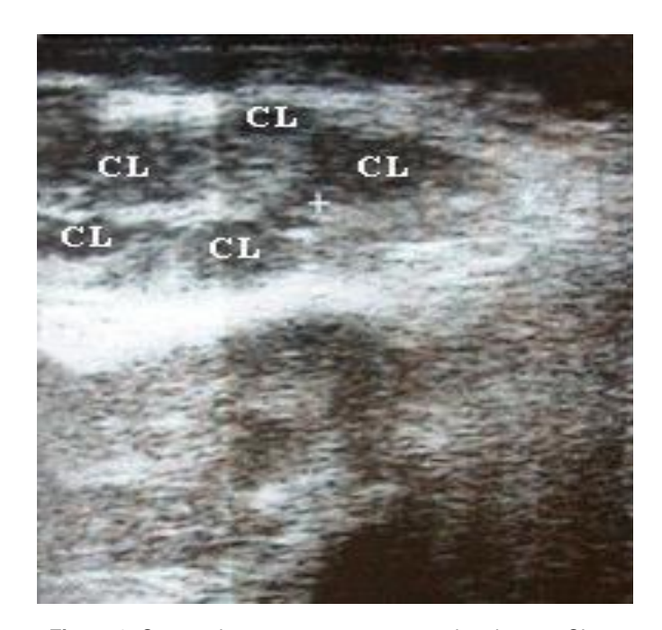
Figure 2. Corpora lutea present on superovulated ovary. CL: corpora lutea.(Toshiba Echography SONOLAYER-L SAL32-B, linear sound of 5 MHz)

Results of superovulation treatments, reported in Table I, show that all donors came into estrus in a mean interval, PG- onset of estrus of 39.5 h after Luprostiol injection, with an average number of corpora lutea per cow, present on the day of collect of 7.5 Our results show that "Cheurfa" breed donors responded to treatment of superovulation and have no variability in the time of onset of their estrous. The mean interval PG-early observed