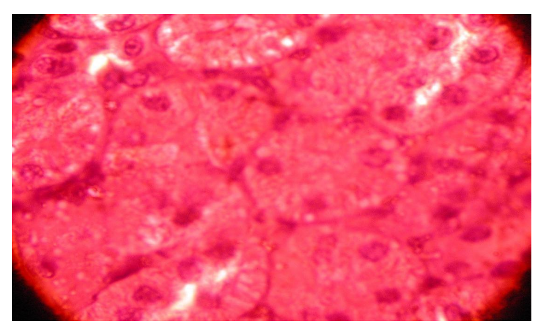
Figure 2. Kidney proximal tubular of control rat. Renal glomeruli show normal structure (GR:100).

provide a good indication of the kidneys function. In our results urinary volume is markedly increased in lead group, the increase of urine might be due to diuretic effect of lead or the high concentration of calcium in plasma. In this study no variation in urinary pH and specific gravity was observed. The work of Ghorbe (2001) showed that the lead induces a decrease of urinary pH observed mainly on and after the 45<sup>th</sup> day of the experiment.