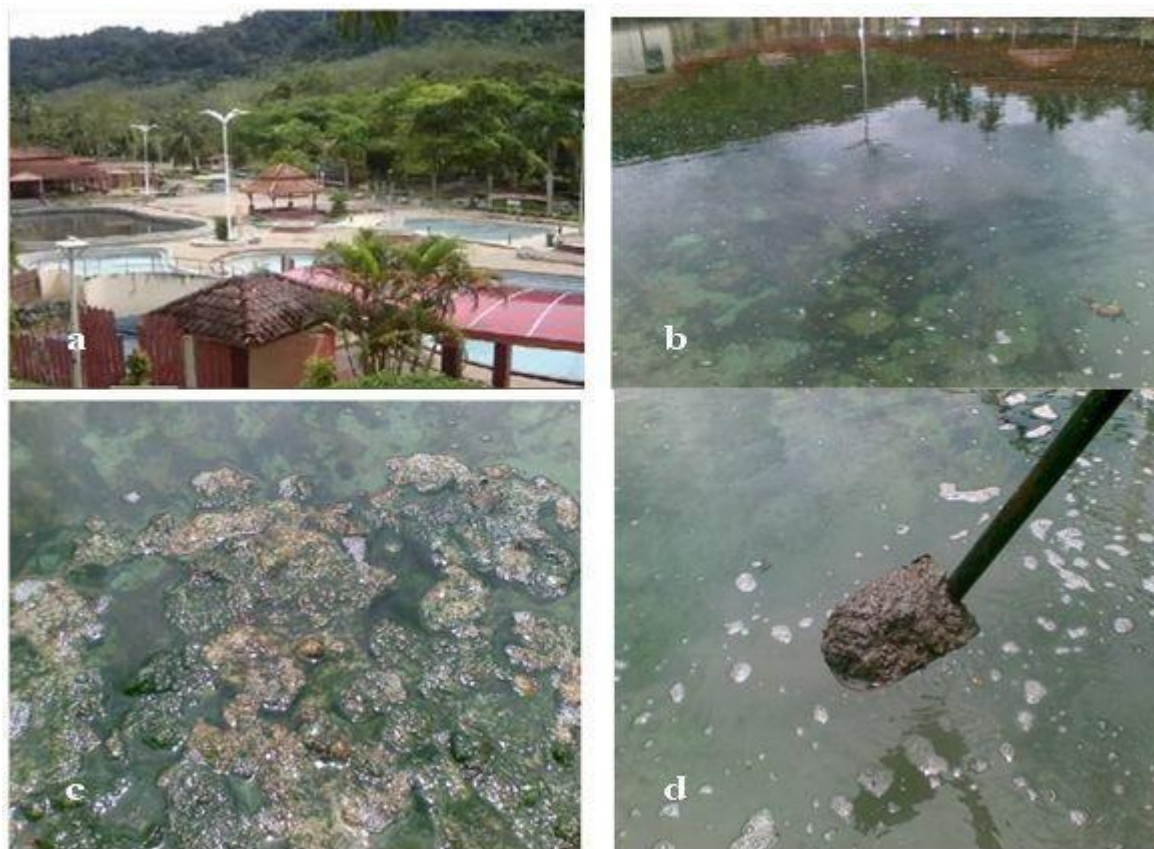
Figure 1. Location of Ulu Legong Hot spring and various sites of for sample collection (a) Ulu Legong hot spring, (b) water, (c) biomat and (d) sediment.

collected from the water surface, biomats and sediments, respectively. These three thermo flasks were sent to the laboratory within a period of three hours before inoculation was done. One milliliter of sample from each flask was transferred to each of the bottles, consisting of 10 ml media in a 30 ml sterilizes universal bottles and was conducted in triplicates. The temperature was 60°C and pH was 7.81.