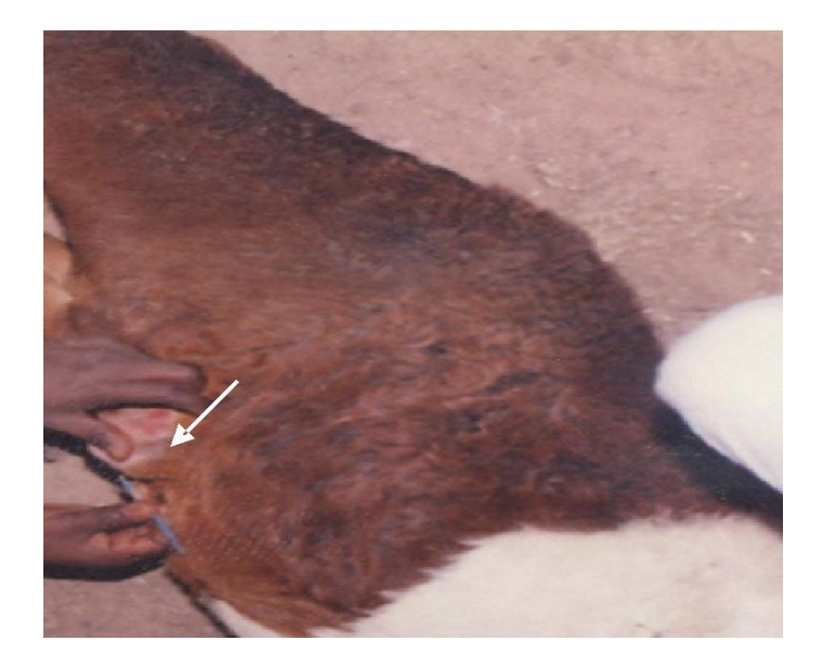
Figure 2. Abscess being infiltrated with Xylocaine before lancing.

offers answers to the major concerns being faced by mankind (Cornborough, 2002). Neem and its products have anti-fungal, anti-bacterial, anti-inflammatory, antiviral, anticancer, antidiabetic and immunomodulatory activities also have been reported to have wound healing properties (Biswas et al., 2002). This case is aimed at reporting the wound healing property/activity of crude neem oil ( A. indica ) in a field situation as there are limited reports on its use in the treatment of septic wounds.