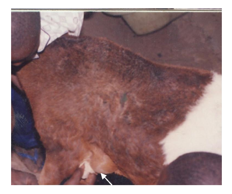
Figure 1. The abscess – Arrow pointing to the circumscribed swelling.