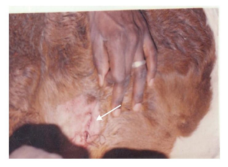
Figure 4. Stitched wound – Arrow points to the stitched area with the most ventral aspect of the wound left unstitched for continuous drainage.