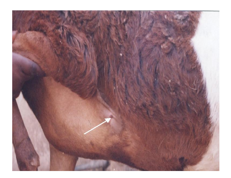
Figure 5. Healed wound – Arrow points to the scar formed after the wound has healed completely.

the seed kernel was purchased from a local processor/vendor in Gombe State, North Eastern Nigeria. A simple interrupted suture was applied to the wound using a silk non-absorbable suture (Figure 4). The most ventral aspect of the wound was left unsutured to allow for continuous drainage. Crude neem oil was then applied topically to the sutured wound. No repeat application of the neem oil was made and no antibiotic (topical or systemic) was given to the ram or applied to the wound. The animal was then monitored daily for a period of 5 days for re-infection and wound dehiscence. None was observed. Neem oil was found to be highly