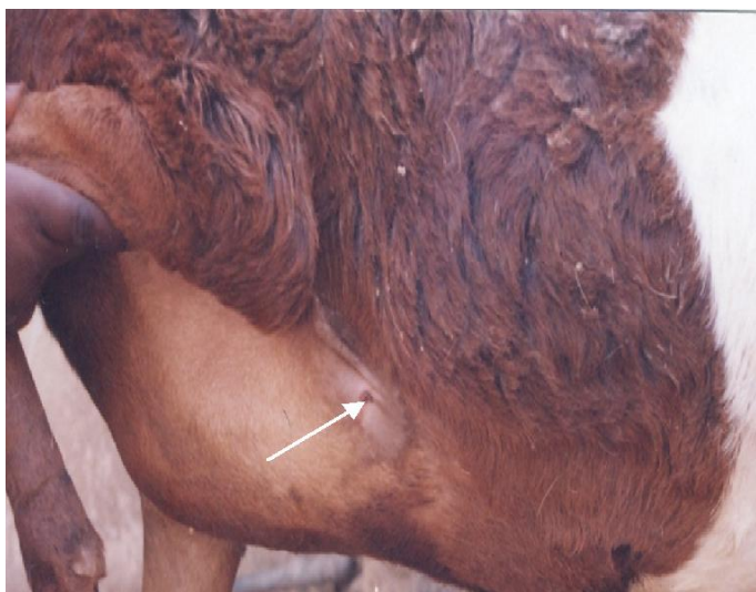
Figure 5. Healed wound – Arrow points to the scar formed after the wound has healed completely.

the seed kernel was purchased from a local processor/vendor in Gombe State, North Eastern Nigeria. A simple interrupted suture was applied to the wound using a silk non-absorbable suture (Figure 4). The most ventral aspect of the wound was left unsutured to allow for continuous drainage. Crude neem oil was then applied topically to the sutured wound. No repeat application of the neem oil was made and no antibiotic (topical or systemic) was given to the ram or applied to the wound. The animal was then monitored daily for a period of 5 days for re-infection and wound dehiscence. None was observed. Neem oil was found to be highly