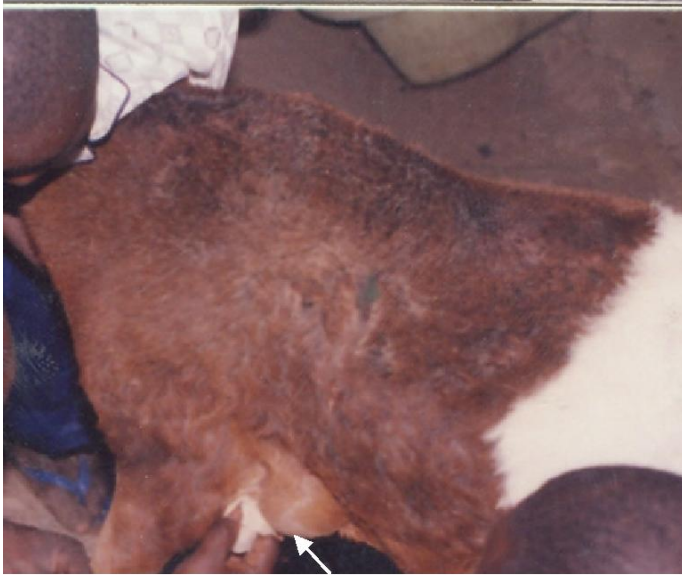
Figure 1. The abscess – Arrow pointing to the circumscribed swelling.