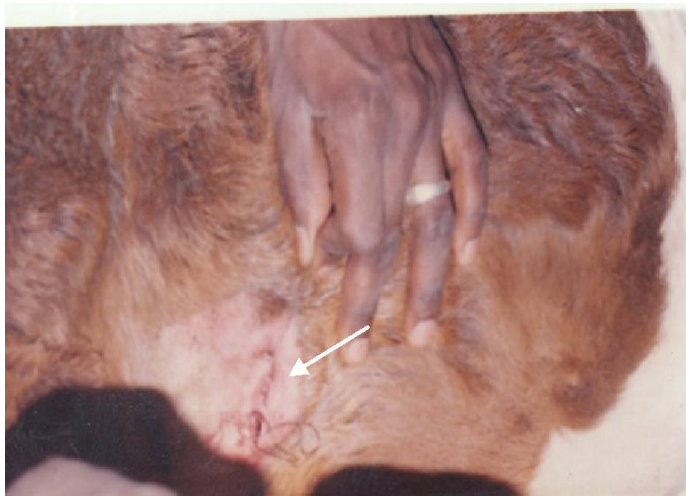
Figure 4. Stitched wound – Arrow points to the stitched area with the most ventral aspect of the wound left unstitched for continuous drainage.