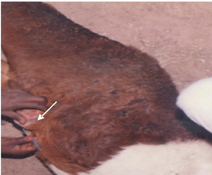
Figure 2. Abscess being infiltrated with Xylocaine before lancing.

offers answers to the major concerns being faced by mankind (Cornborough, 2002). Neem and its products have anti-fungal, anti-bacterial, anti-inflammatory, antiviral, anticancer, antidiabetic and immunomodulatory activities also have been reported to have wound healing properties (Biswas et al., 2002). This case is aimed at reporting the wound healing property/activity of crude neem oil ( A. indica ) in a field situation as there are limited reports on its use in the treatment of septic wounds.