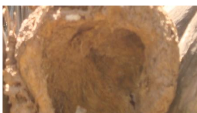
Figure 3. Anchote (mother plant) attacked by rodents (photograph taken by the researcher, Gimbi, Warra Sayo, 2011).