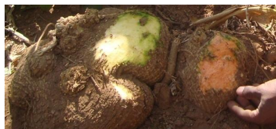
Figure 2. Anchote tuber aged more than ten years and color of tubers (photograph taken by the researcher).