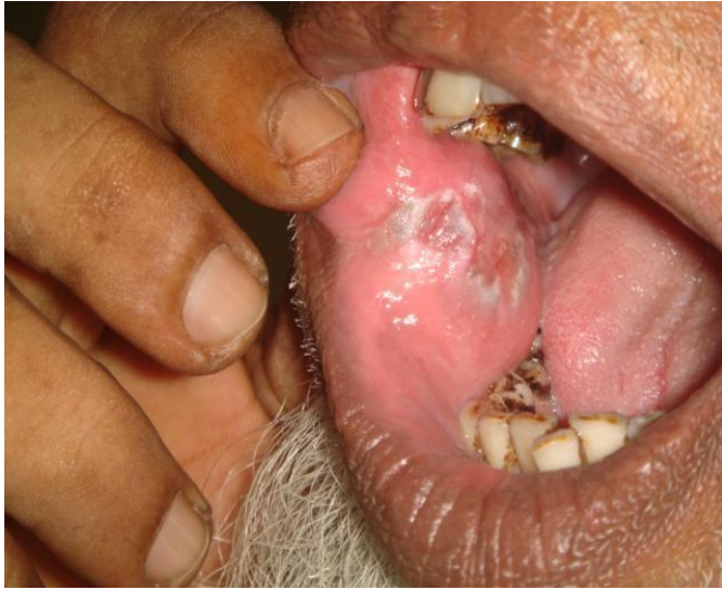
A. Figure 1. Lesion on right oral buccal mucosa.