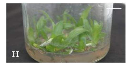
Figure 2H. Plant regeneration from immature seeds of white flower mutant of R. gigiantea (Lindl.) Ridl. through somatic embryos. Plant- lets in bottle (bar: 1cm).

roots elongated to 0.5 - 2.0 cm by 80 days of culture shoot (Figure 2 H). Rooted plantlets were washed medium and planted in the mixture of coconut fibre and sand (3:1) and acclimatized in a mist house. The surviving rates of R. gigantea were more than 95%.