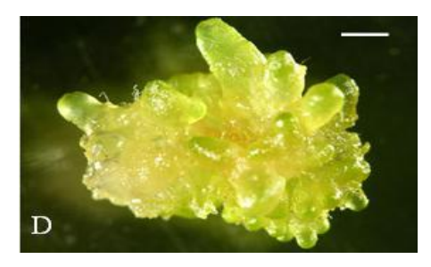
Figure 2D . Plant regeneration from immature seeds of white flower mutant of R. gigiantea (Lindl.) Ridl. through somatic embryos. Fingerlike somatic embryos (bar: 500 \mu m ).