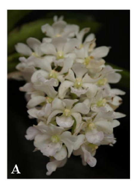
Figure 1A . Flower of R. gigantea (Lindl.) Ridl. Flower of mutant of R. gigantea (Lindl.) Ridl.