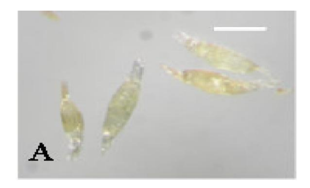
Figure 2A. Plant regeneration from immature seeds of white flower mutant of R. gigiantea (Lindl.) Ridl. through somatic embryos. Expanded immature seeds after 25 days culture (bar 1000 μm).

The exiguous white seeds were transferred to half-strength MS