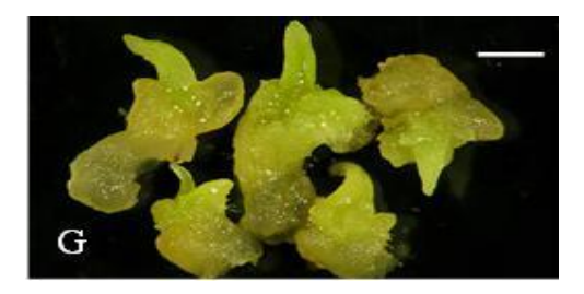
Figure 2G. Plant regeneration from immature seeds of white flower mutant of R. gigiantea (Lindl.) Ridl. through somatic embryos. Isolated shoots with one real leaves cultured on MS medium for 45days (bar: 1mm).