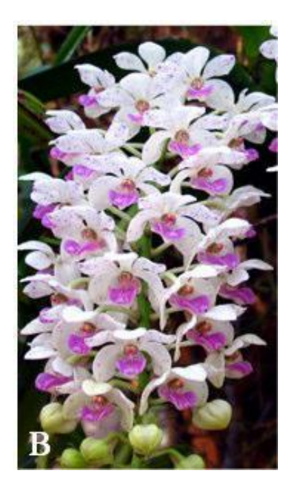
Figure 1B. Flower of R. gigantea (Lindl.) Ridl. Flower of wide type of R. gigantea (Lindl.) Ridl.

15 min. The growth regulators (BA and NAA) were filter-sterilized before being added to the autoclaved culture media. Contents of media used in this experiment were listed in Table 1. Cultures were incubated at (25 \pm 2)°C under 14 h photoperiod with light supplied by cool-white fluorescent lamps at an intensity of 45 - 50 \mu mol m ^{-2} s ^{-1} .