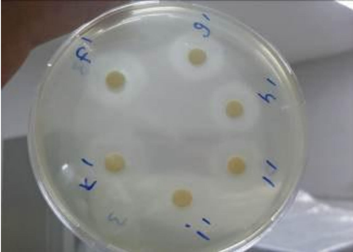
Figure 1. Antimicrobial activity of L. bulgaricus and S. thermophilus strains against to E. coli .