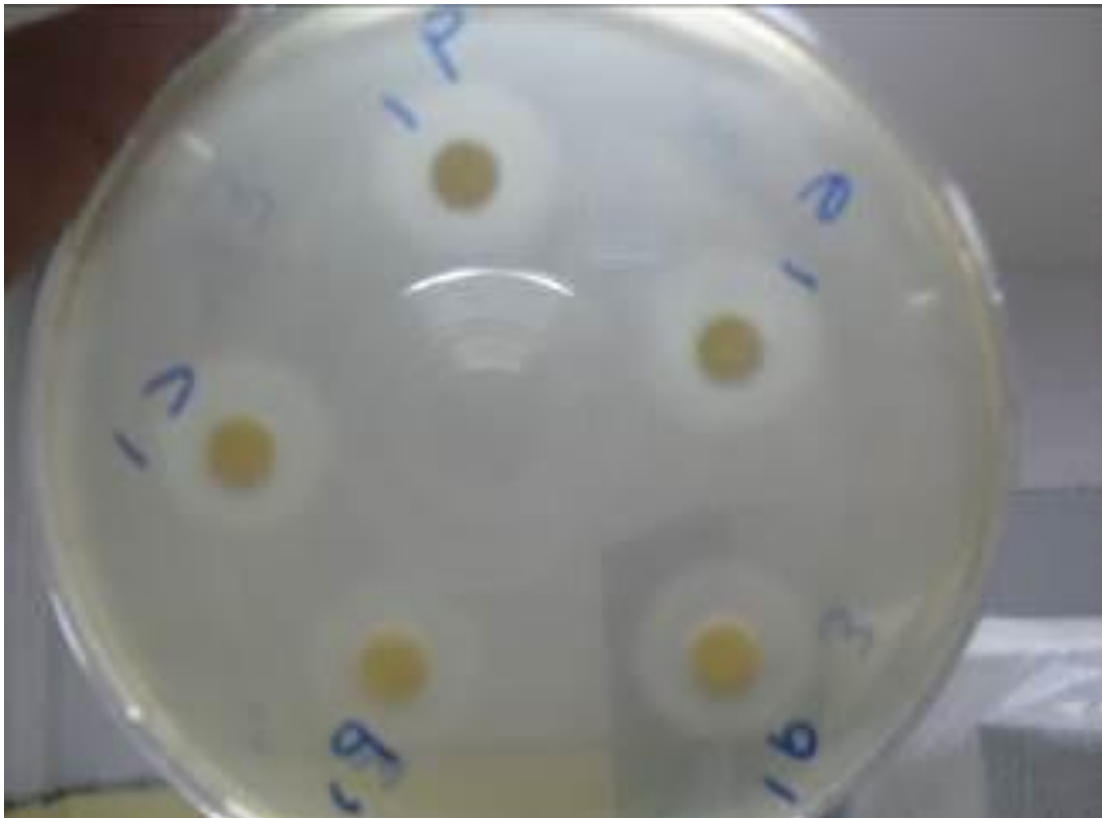
Figure 3. Antimicrobial activity of L. bulgaricus and S. thermophilus strains against to L. monocytogenes .