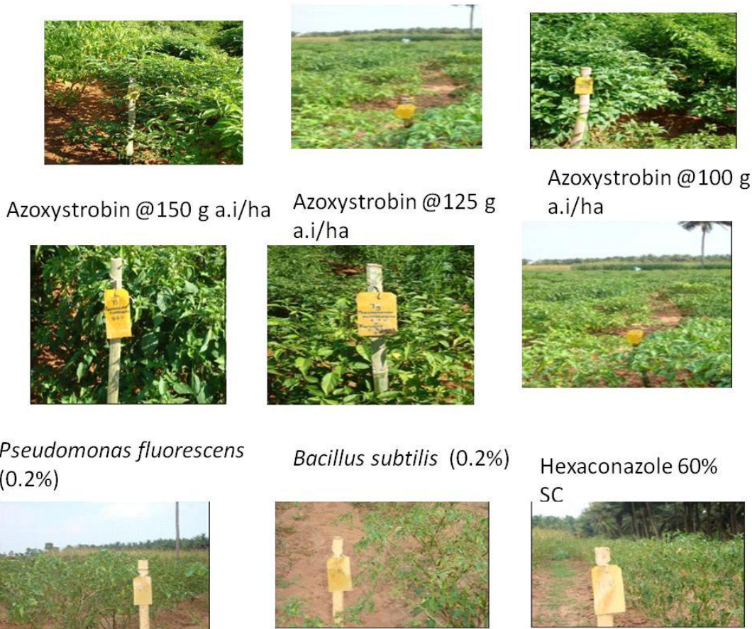
Figure 1. Efficiency of Azoxystrobin 25 SC against chilli powdery mildew diseases.