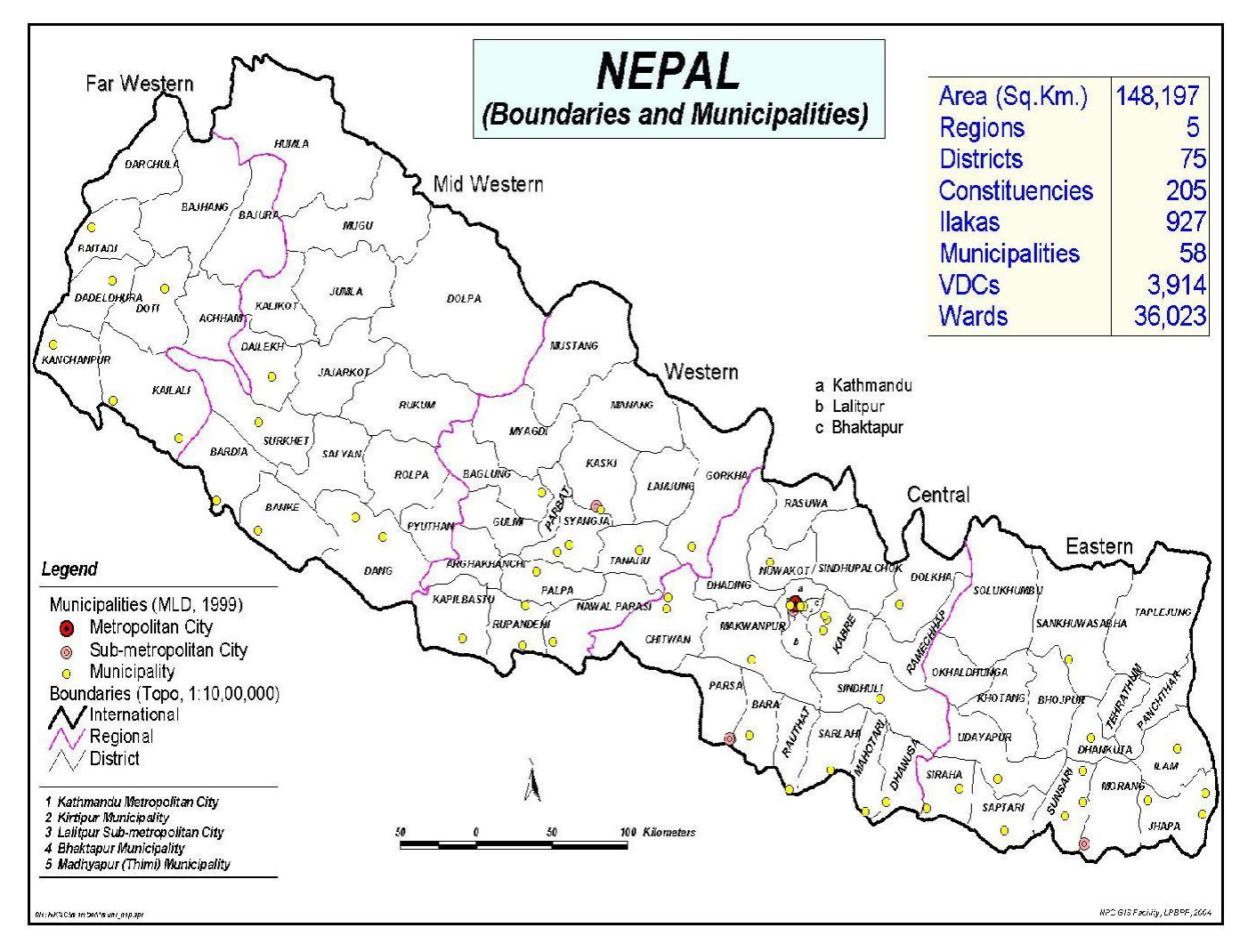
Figure 2. Current Administrative Structure of Nepal.