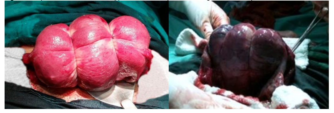
Figure 2. Aspects of the uterus after application of the triple vascular ligation and compressive uterine suture.

(2g/h) and oxytocin (4IU/h). She developed hemolysis, and a small subaponeurotic hematoma identified by ultrasonography that was clinically managed. She received new blood transfusion (600 ml of red blood cells), remained four days in the intensive care unit and six more days in ward having evolved with good pressure control and hospital discharge without antihypertensives.