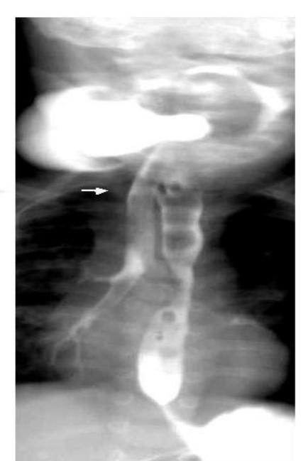
Figure 4: AP view depicting a typical H-type Figure 4. AP view depicting a typical Htracheo type tracheooesophageal(Source: patient's data). patient's data)