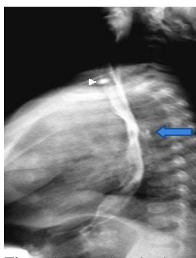
Figure 1: Lateral projection; arrow showing Figure 1. Lateral projection; arrow

spillageshowingspillageofcontrastofcontrastintointothethelungs lungs. Arrow head shows artifact. (Source: patient's data).