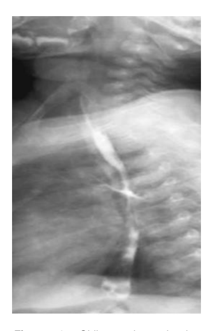
Figure 2. Oblique view showing contrast leakage but no obvious H-type fistulous connection.

positioned with foam pads as though the child was sucking from the breast.