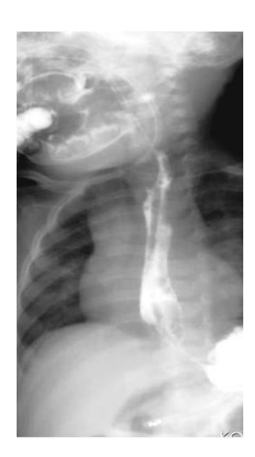
Figure 5. Post-surgery repair oesophagram shows no trachea-oesophageal fistula.

projection due to the struggling state of the child. Here the rest of the contrast (about 12 ml) was poured into a feeding bottle (a bottle with nipple like tip) and given to the child to drink continuously while in the AP position.