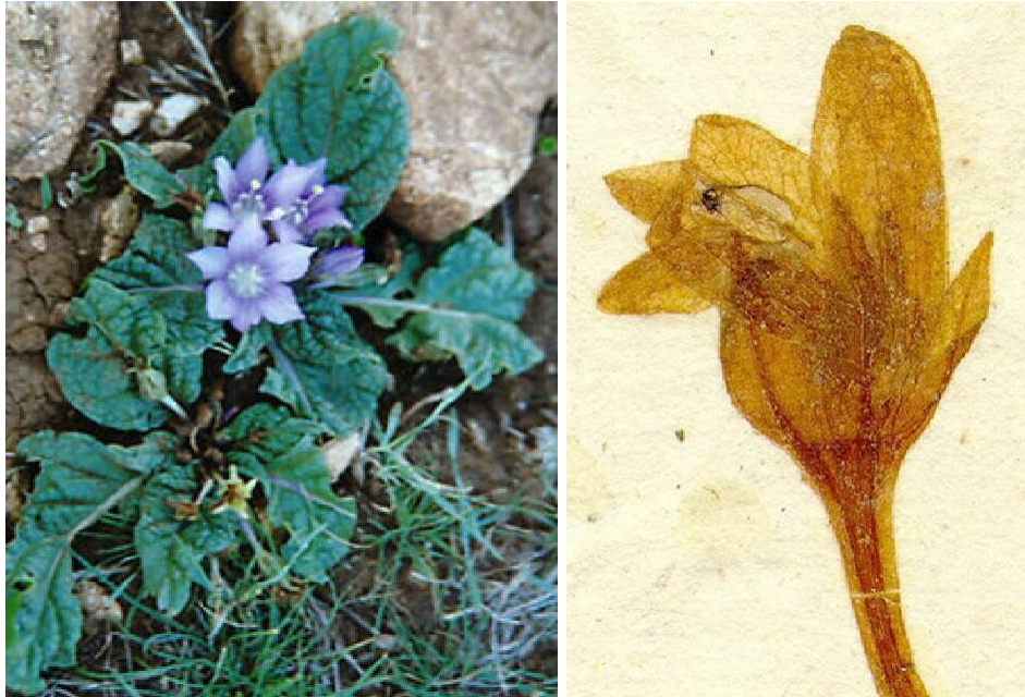
Figure 1. Mandrake (Mandragora) an excitant, medicine and poison.