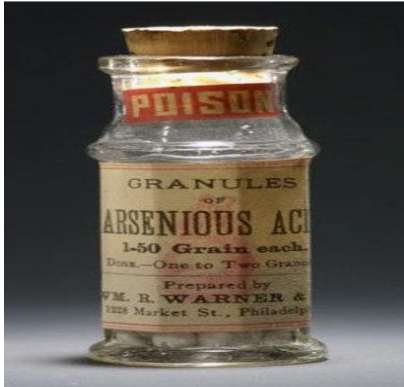
Figure 3. Arsenic