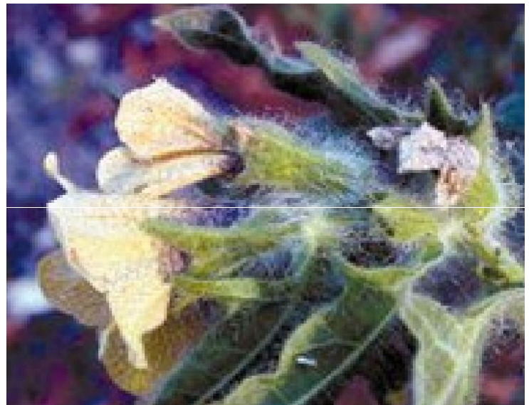
Figure 2. Henbane (Bunika)

The Friar poisoned the King with arsenic (and died himself from it), while Cleopatra died from an asp poisonous bite (Egyptian cobra). A snake uses the venom in its food digesting process and therefore the venom of a hungry