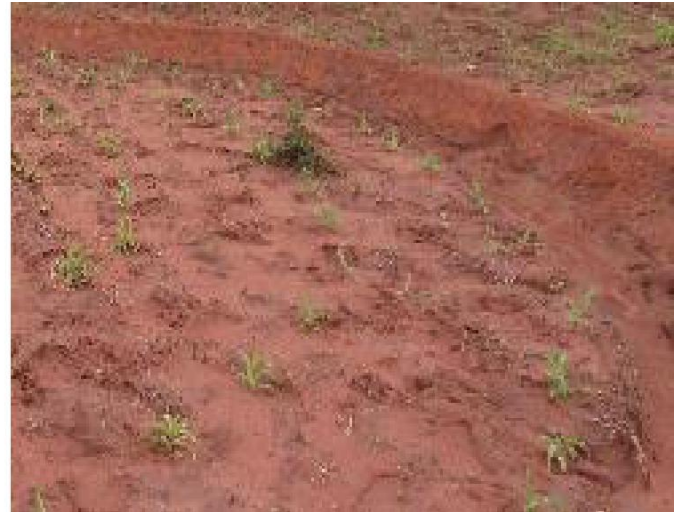
Figure 4. Earth bund built on contour line.