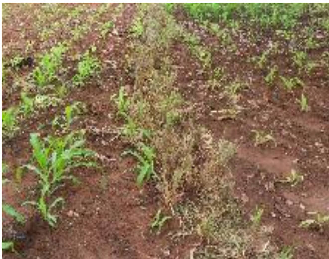
Figure 3. Grass strip built on contour line.