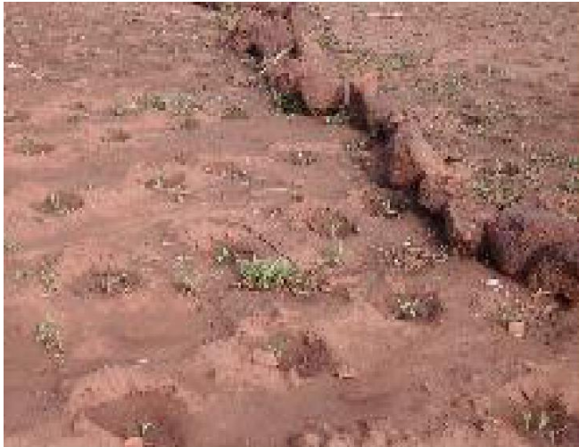
Figure 2. Stone row combined with zaï pits.