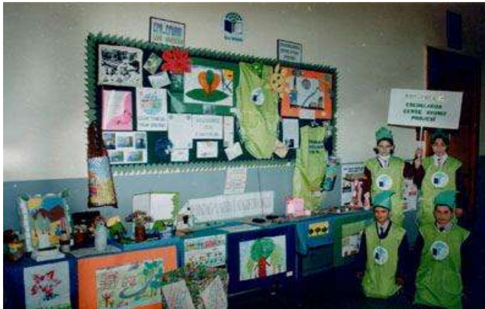
Figure 2. Eco-Schools project.

and making sure that the students comprehend the issues completely, can carry on their studies in the sub-branch fields like bio-diversity, extinct animals, etc. Studies carried out throughout the year are scheduled with an activity plan. To carry out studies in accordance with the plan, finding out the false parts and removing with the suggestions are handled by the students. Coordinator teacher reports the studies to the National Coordinator of Project at the end of the year. Coordinator evaluates the school's success by examining the activity plan and the report at the end of the year (UNCED, 1992).