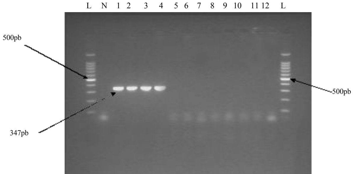
Figure 2. Agarose gel electrophoresis of PCR product for the presence of IS upstream of ampC gene of A. baumannii . Lane L represents the 100bp DNA ladder. Lane N represents the negative control. Isolates 1-4 represents the (B-lactams resistant isolates) which showed positive for the presence of the IS- ampC gene. Isolates 5-12 represents the (B-lactams susceptible isolates) which showed negative for the presence of IS ampC gene.