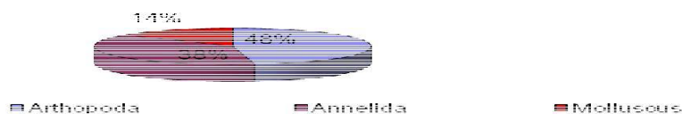
Figure 2. Population density of different groups of macrozoobenthos present in the Shallabugh wetland.

body. Considering the BOD profile of the wetland it is revealed that BOD level rises abruptly upto 34 mg/l during summer season which is indicative of an augmented organic load besides rapid growth of microorganisms at high temperature as also stated earlier by Joshi and Bisht (1993). In the spring season the BOD rises mildly due to heavy entry of water from the Sindh stream and from Anchar lake carrying organic wastes from the catchment area while its fall during a prolonged autumn–winter juncture, is indicative at low temperature.