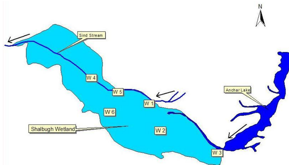
Figure 1. Map of Shallbugh wetland showing sampling sites.

received hitherto much attention from limnologists except some sporadic studies (Handoo, 1978; Balkhi and Yousuf, 1992; Siraj et al., 2007). Thus there is considerable dearth of information available on various aspects especially the benthic community structure of this wetland. In view of its changing characteristics, the present study was carried out to assess the effect of physico-chemical parameters on the diversity and distributional pattern of macrozoobenthos.