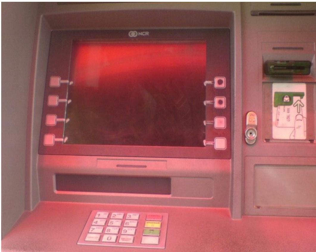
Figure 1. A typical ATM.