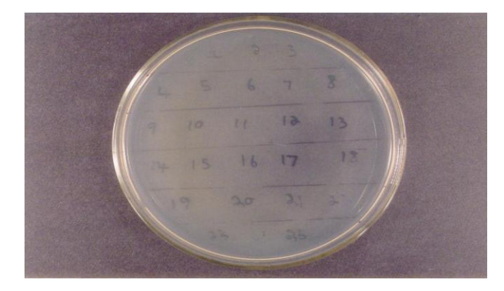
Figure 5. MIC of ceftriaxone <0.125 µg/ml.

Salmonella like colonies and Salmonella species was identified by Biochemical Reactions and Antibiotic sensitivity. Further confirmation was done by serological reactions which were performed by slide Agglutination with anti-sera. After identification, Antibiotic sensitivity testing was done by Kirby-Bauer Method as seen in Figure 1. The tests were interpreted by comparing with the Kirby-Bauer table. The control strain used was E. coli (ATCC 25922). MICs of isolates were determined by the standard plate agar dilution method according to National Committee for Clinical Laboratory Standards (NCCLS) guidelines (14). The Minimum inhibitory con-