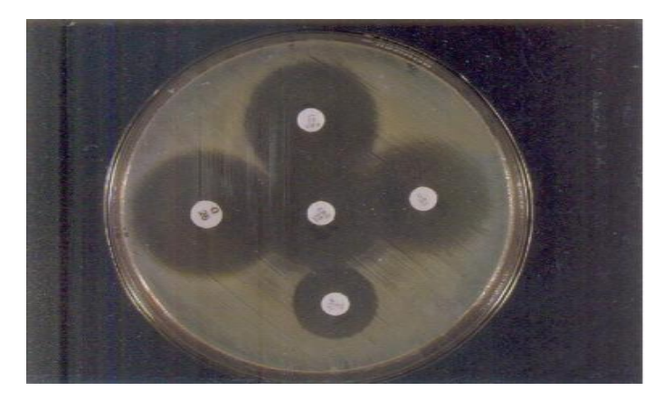
Figure 1. Kirby- Bauer method of sensitivity.