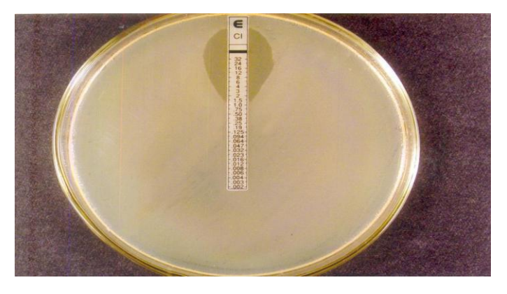
Figure 2. E-test for MIC calculation.