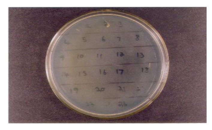
Figure 4. MIC of ciprofloxacin 0.5 µg/ml.