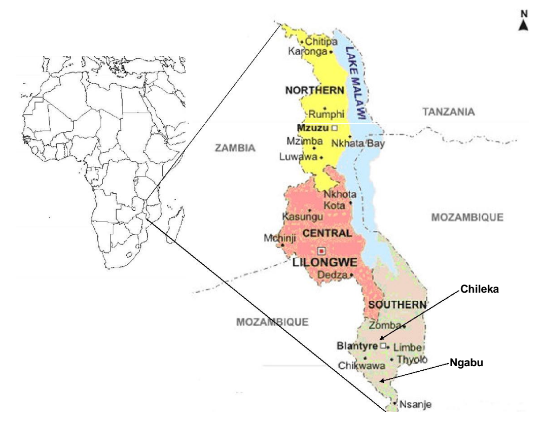
Figure 1. Map of Africa and Malawi showing location of the study sites.

approaches range from direct measurement of evapotranspiration to empirical models that use climatic data as input variables. The direct measurement of evapotranspiration is tedious, time consuming and expensive, hence the use of weather data to indirectly estimate evapotranspiration offers an easy and very reliable alternative. A high degree of precision in estimating crop evapotranspiration may permit important water savings in the planning and management of irrigated areas (Perez et al., 2008). For agricultural purpose, Xiaoying et al. (2005): Donatelli et al. (2006) indicated that reliable estimation of evapotranspiration is required for an efficient water management. Careful estimation of ETo is important for irrigated area, because it is the fundamental for obtaining high water productivity.