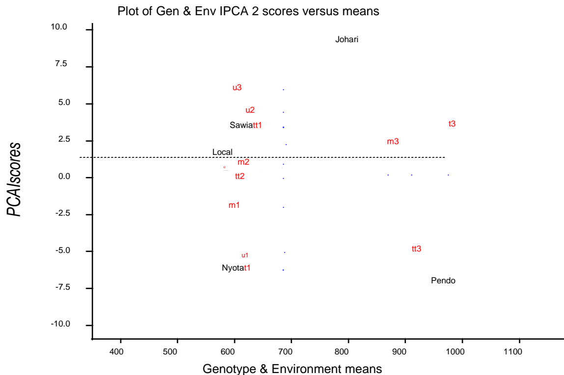
Figure 3. IPCA1 scores of five varieties, twelve environments and genotype x environment means. Key: u1, 2 and 3 = Usanganya for seasons 1, 2 and 3; m1, 2 and 3 = Mkolye for seasons 1, 2 and 3; t1, 2 and 3 = Tumbili for season 1, 2 and 3; tt1, 2 and 3 = Tutuo for seasons 1, 2 and 3. Local = Mamboleo.