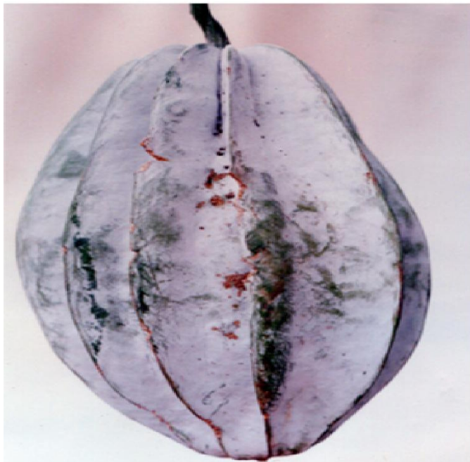
Figure 1. Flouted whole fruit of Telfairia occidentalis

effectively used in lowering blood cholesterol and preventing blood clotting (Weiner, 1992).