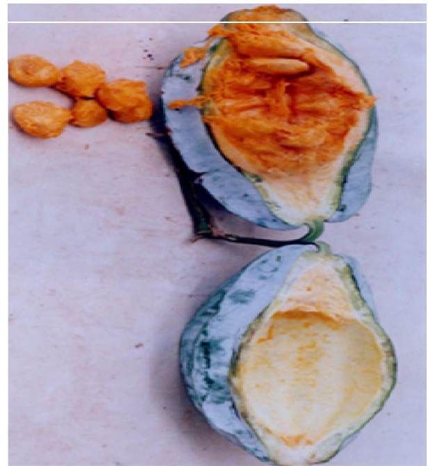
Figure 3. Seeds detached from the inner arrangement T. occidentalis

alis fruit is presented in Table 1. Figures 2 and 3 show seed arrangement and some individual seeds. The occurrence of seeds in each fruit was fairly regular. A mean number of 71.5 seeds per fruit was obtained. The result showed that it is possible with some measure of certainty to tell the number of seeds in a given set of T. occidentalis fruits. This gives room for good planning in farming a given target area.