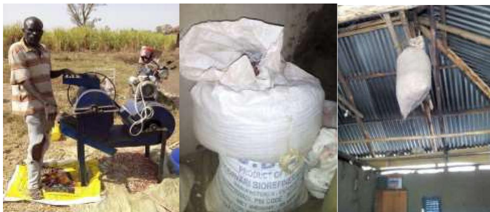
Figure 2. A farmer operating a manually operated groundnut sheller with electric motor and storage containers and place in Homa Bay County.