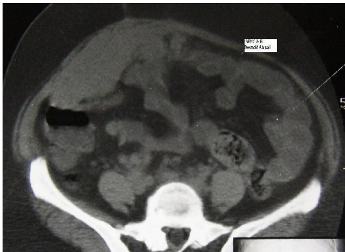
Figure 2. CT shows the mass arising from the right parietal wall of the abdomen.

they can arise from any skeletal muscle (Pack and Ehrlich, 1944). The myofibroblast is thought to be the cell of origin of these benign, but locally invasive lesions (Wu et al., 2010).