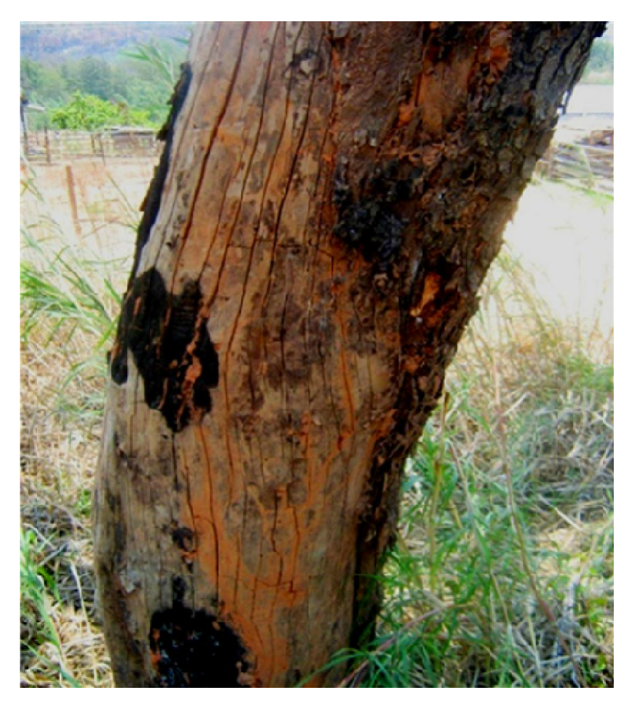
Figure 4. A P. africana stem showing a scar caused by fire in Nyanga National Park, Zimbabwe.

Luba, Lago Biao and the settlement of Moca were to be protected as a scientific reserve (Terry et al., 1999).