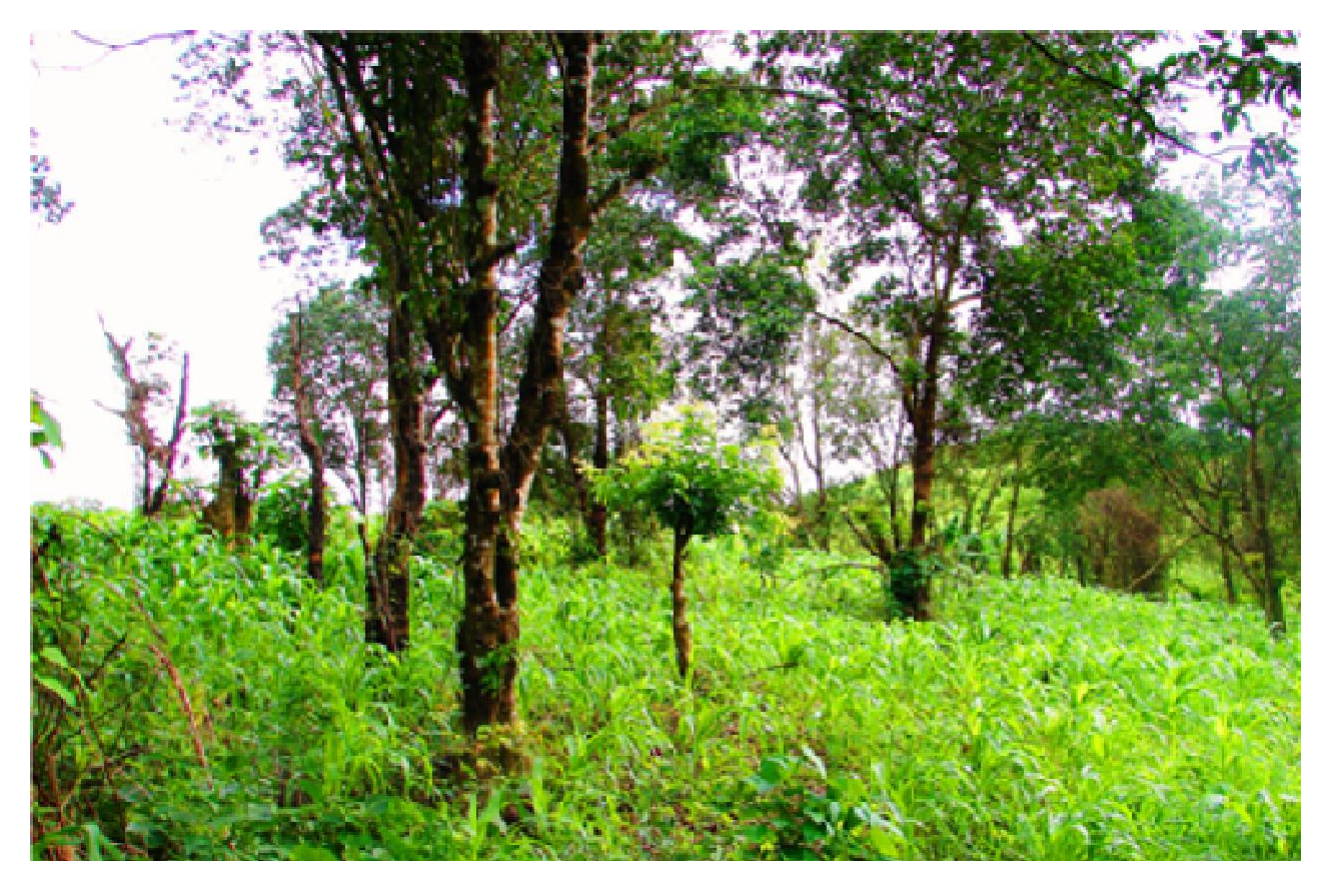
Figure 5. P. africana intercropped with maize in the Western Region of Cameroon.

Therefore, bark harvesting can provide the much needed income, releasing pressure on the few remaining natural populations and at the same time protecting the genetic diversity of P. africana on-farm. P. africana domestication can be done by promoting its cultivation in farmers' fields, community nurseries and fields. There is need to have information on the origin and genetic variation of the reproductive material. On-farm conservation becomes increasingly important in areas where natural forests are contracting, for example through agricultural expansion. On-farm planting of P. africana has been practiced in Cameroon (Dawson et al., 2001). Figure 5 shows an agroforestry system in which P. africana was intercropped with maize in Cameroon.