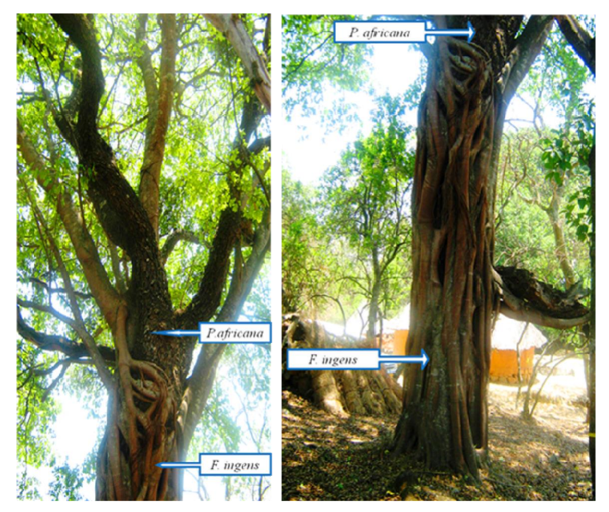
Figure 3. P. africana trees under threat from F. ingens in Nyanga National Park, Zimbabwe.

authority of the country exporting advises its manage-ment authority on the sustainability of a consignment and the export permit would be based on a sound inventory and management information (Terry et al., 1999). All exporting countries are signatories to CITES and this should mean that, the P. africana bark entering the EU is harvested from a sustainable source. However, this is usually not the case because quotas and permits are being issued without reference to adequate biological baseline information. In addition to CITES, many countries have their national policies and regulations which govern conservation of P. africana. The Forestry Law (1995) of Equatorial Guinea (Reglamento de Aplicacion de la Ley Sobre el Uso y Manejo de los Bosques EQG/96/002) seeks to ensure sustainable management of commercially exploited nontimber forest products (NTFP) like P. africana (Articulo 62) (Terry et al., 1999).