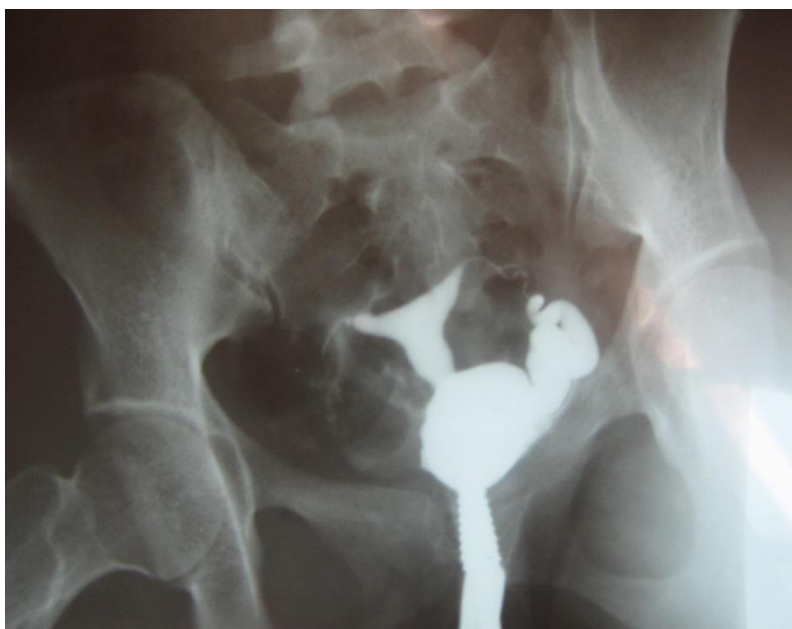
Figure 5. HSG showing dilated left fallopian tube (hydrosalpinx) without spillage of contrast medium into the peritoneal cavity. The right tube is proximally occluded.

tubal occlusions and 9 patients for confirmation of pelvic adhesions. Also, 21 patients diagnosed at HSG with intra uterine adhesions, had diagnostic and therapeutic hysteroscopy performed. Using laparoscopy with dye test and hysteroscopy as gold standards, findings were compared with HSG diagnosis. Table 4 shows that, out of