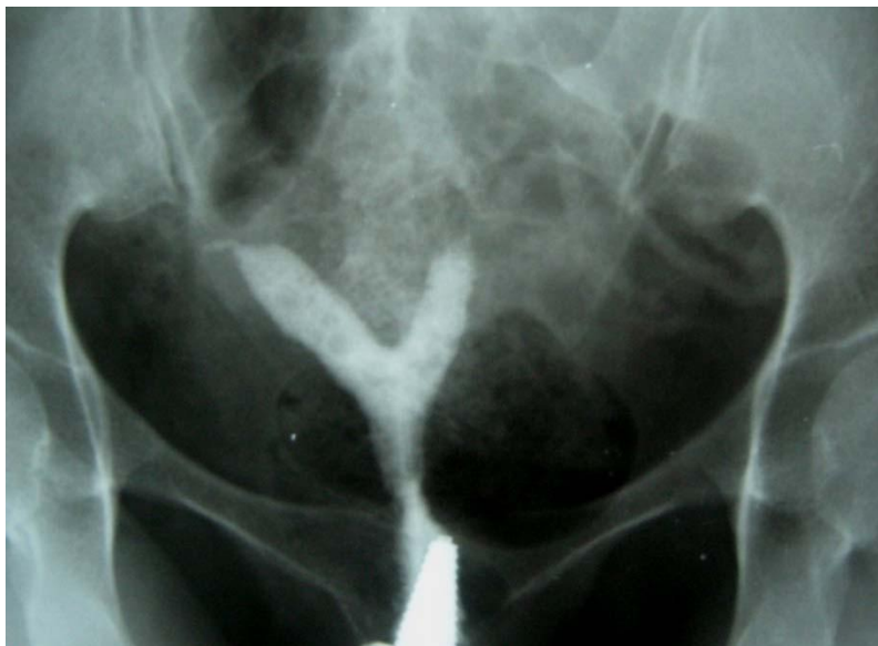
Figure 4: HSG image showing symmetrically separated uterine cavity with a single cervical canal (bicornuate unicollis uterus). Both fallopian tubes are proximally occluded.