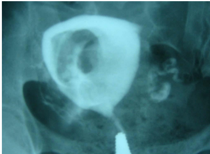
Figure 3. HSG image showing a grossly dilated uterine cavity with a filling defect due to submucous fibroid. The left tube is visualized and patent. The right tube is not visualized.

seen on HSG as small diverticula extending from the lumen of the tubes, 2 (0.9%) were bilateral while the remaining 2 (0.9%) had left SIN. There were 17 patients (7.7%) with pelvic adhesion, seen as loculated spill, convoluted or crowded tubes and vertical oriented tubes. Bilateral pelvic adhesion was seen in 5 patients (2.3%).