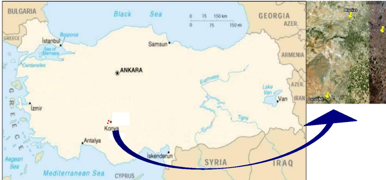
Figure 1. Location of the study areas in Turkey map and Google earth satellite image.