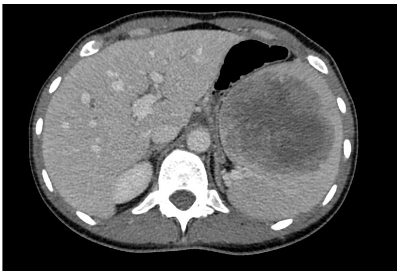
Fig 2. CT by improved contrast shows an iso-dense mass in the spleen with liver angiomas.

The macroscopic appearance reveals a mass of 3 to 17cm, non-encapsulated, well demarcated from the rest of the spleen. The splenic parenchyma is the site of angiomatousred-brown nodules separated by a c (fig. 4). The microscopic appearance helps discover nodules of varying size, composed of vascular structures whose immunohistochemical analysis finds different normal vascular components of red pulp that are sinusoidal lining cells, capillaries and small veins. Immunohistochemical staining of the small vessels in the lesion were positive for CD34, CD31, CD68 and CD163, and negative for CD8. Histological sections and immunohistochemical staining performed on the lesion of the spleen confirmed the diagnosis of SANT.