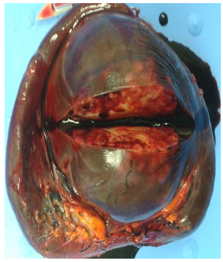
Fig. 3 hemorrhagic cross section of SANT after splenectomy

even been suspected on the ultrasound scan in our patient. SANT sometimes takes the aspect of a solitary mass, as in our case; defined, it measures between 3 and 17 cm in large diameter with a bumpy surface separated by a dense fibrotic stroma, gray-white with hemorrhagic sites that may evoke an inflammatory pseudo tumor of spleen (Abbott et al., 2004). As for MRI, it brings out the dual component in the form of areas in T2 hyper-signal predominantly peripheral, performing radial spans, with enhancement after injection gradually and centripetal corresponding to the intra-lesion vascular phase that contrasts with the fibro-sclerotic component that is less vascularized (Bamboat et al., 2010). In fact the suspicion of the diagnosis of SANT is established from radiological images and confirmation is made by histological and immunohistochemical examinations (BurneoEsteves et al., 2012).