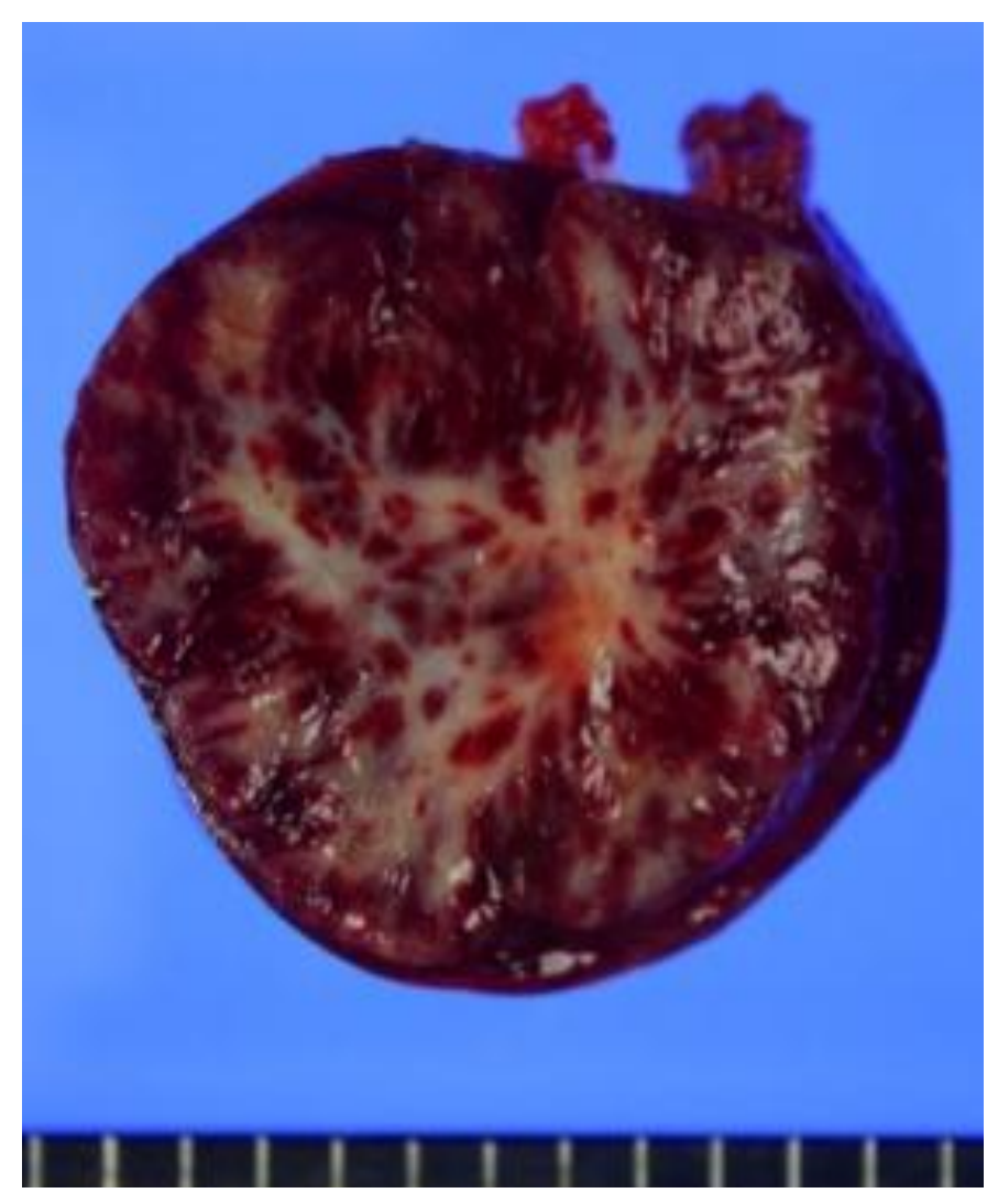
Fig 4 . Mass of 3 to 17cm, non-encapsulated, well demarcated from the rest of the spleen, site of angiomatous red-brown nodules separated by a fibrosclerotic stroma.

Post-splenectomy immunohistochemistry is the only to confirm the diagnosis of (BurneoEsteves et al., 2012). However because of preoperative diagnostic difficulties, percutaneous biopsy of the spleen was advocated by (Gutzeit et al 2009). Wang et al., (2012). This needle splenic biopsy was used as in our case by Weinreb et al. that suggests that this method helps distinguish SANT from other lesions (Gutzeit et al., 2009). Although SANT is a distinct histological entity, several vascular lesions both benign and malignant, such as inflammatory pseudo-tumor of spleen, splenic hemangioma, splenic hamartoma, littoralcell angioma, endothelialhemangioma, angiosarcoma and primary splenic lymphoma can be discussed. However, there is concern about the risk of intraperitoneal dissemination if the biopsied lesion proves to be angiosarcoma. Other complications such as rupture of spleen and splenic post puncture biopsy bleeding may