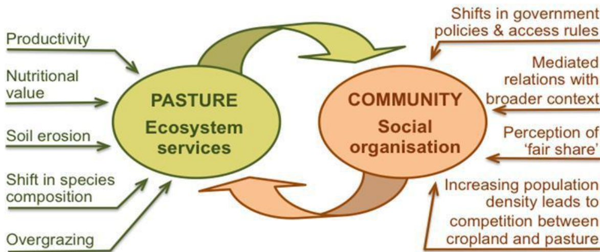
Figure 3. Interactions between the social and ecological subsystems. As a social-ecological system, the communal pasture is shaped by both ecological and social processes. The social processes were not only driven by experiential knowledge, but also by the broader context and what is locally perceived as desirable and feasible.

Furthermore, this questioning is fuelled by broader societal changes, especially development efforts targeting the empowerment of women and the access to resources by poor community members (Aregu, 2014: 59ff).