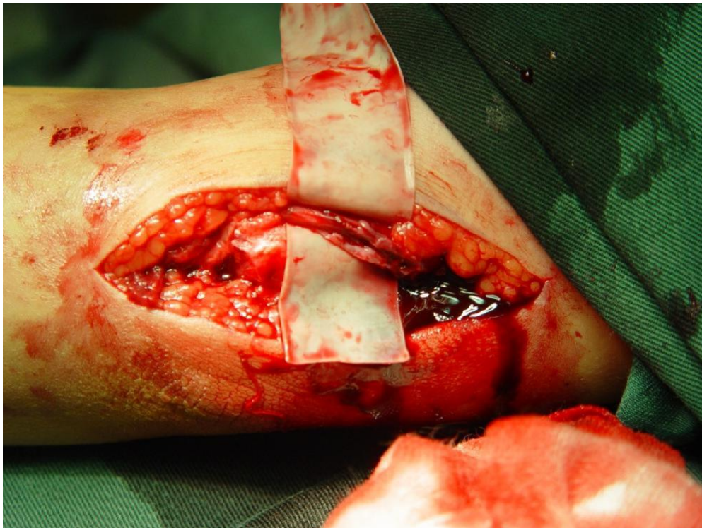
Figure 5. In operation the epineurium of ulnar nerve was cut open, and the hematoma was cleared completely.

have hypoaesthesia three months after operation. After rehabilitative exercises the grip strength of the right hand,