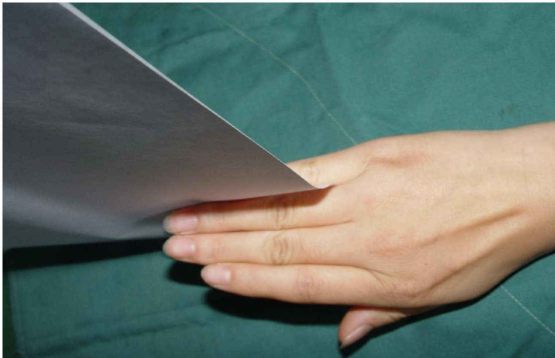
Figure 7. The froment syndrome of right hand is negative.

to everyday textile work (Figure 6). At the time of this writing the patient is asymptomatic and no evidence of recurrence was seen at 29 months of follow-up. Only